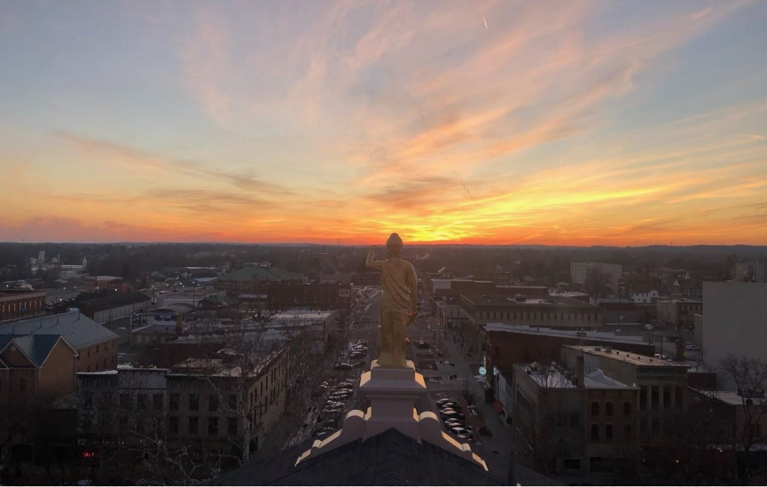
This “winter twilight” photo looks to the west with one of the restored “Ladies of Justice” statues on the Courthouse witnessing the beauty!